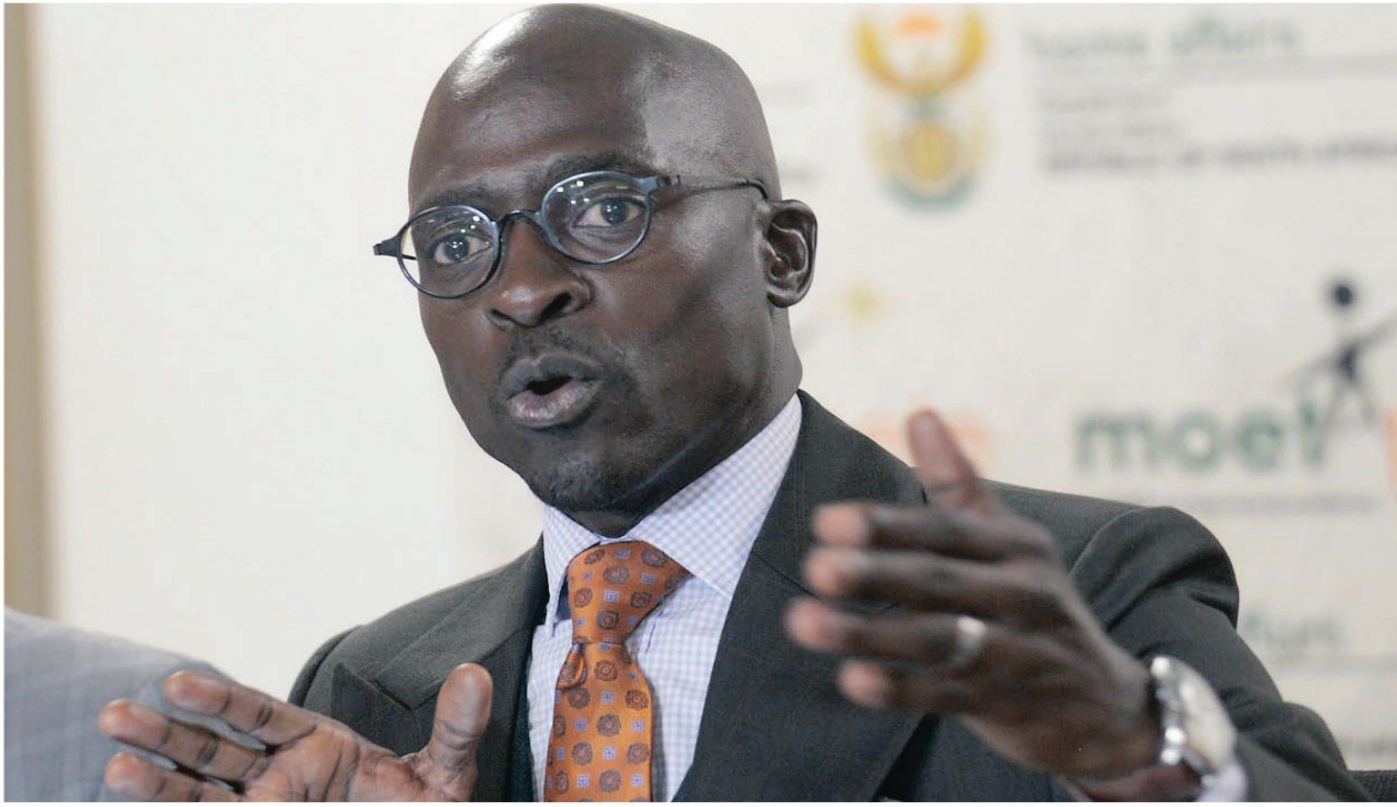
WARNING: Home Affairs Minister Malusi Gigaba has warned against attacks on foreigners.

"Given the urgency of this matter, the commission strongly urges these offices to provide it with a response by no later than 12pm on Thursday," said SAHRC.